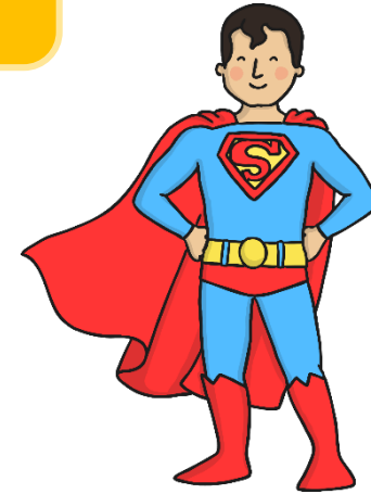
Captain Question Mark