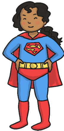
Exclamation Mark Girl