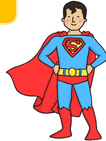
Captain Question Mark