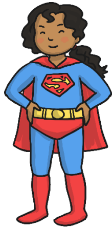
Exclamation Mark Girl