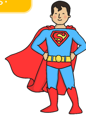
Captain Question Mark