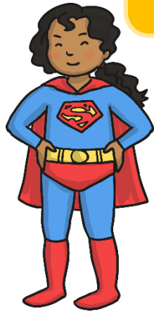
Exclamation Mark Girl

What shall I wear to my cousin's wedding?