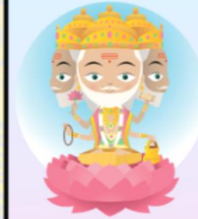
Brahma The Creator