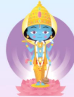
Vishnu The Preserver