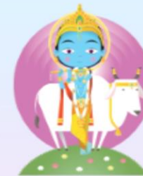
Krishna - eighth avatar of Vishnu The supreme deity