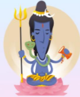
Shiva The Destroyer