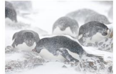
Penguins in a snow storm

Combining the freezing temperatures with it being windy and dry, I realise it is incredibly cold. Temperatures during the summer rarely reach above -20 degrees while winter temperatures can plummet to -60 degrees. You would think it would be warmer during the summer with the continuous direct sunlight from October to March!