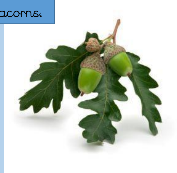
Oak leaves with acorns.