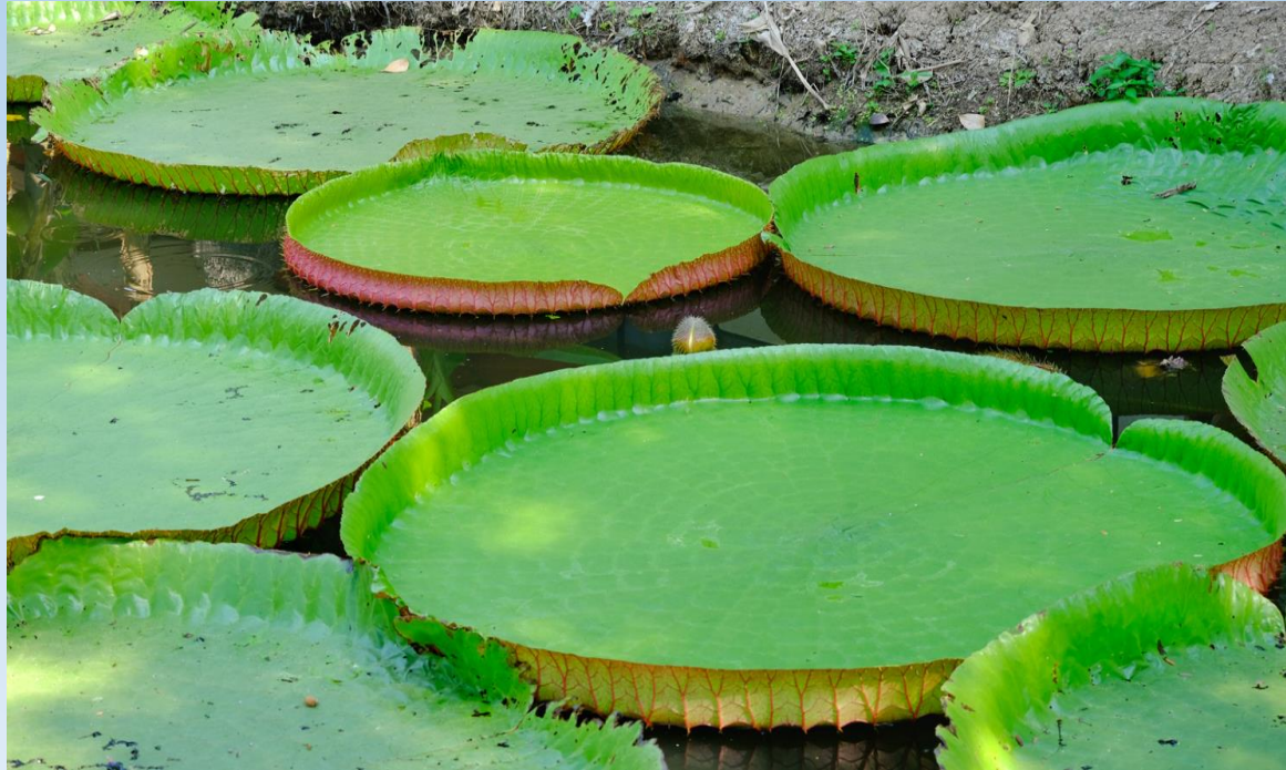
Amazonian Water Lily

Can you share a similarity or difference between these two leaves?