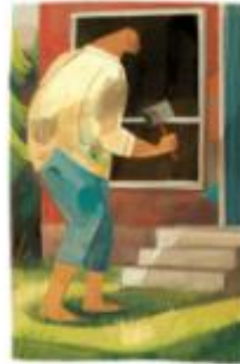
Then they chopped down more trees and built bigger homes.