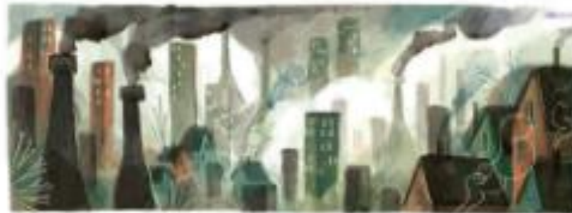
The houses grew into towns and the towns grew into cities. They built factories and shops and cars and planes. They worked all day and all night, until eventually...