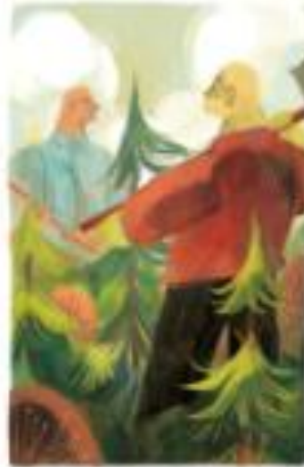
They chopped down trees to build homes.